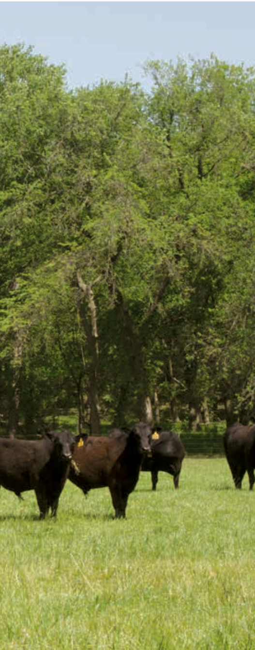
► Left: Texas AgriLife Extension Beef Cattle Specialist Ted McCollum suggests using recent high incomes on long-term pasture improvements.

terms of time and expertise? What is your current livestock production model, and what would you like it to be? What can your land resources handle in terms of vegetation and available water? What developments, like fencing or water sources, do you need to add? Finally, but importantly, what financial shape are you in?